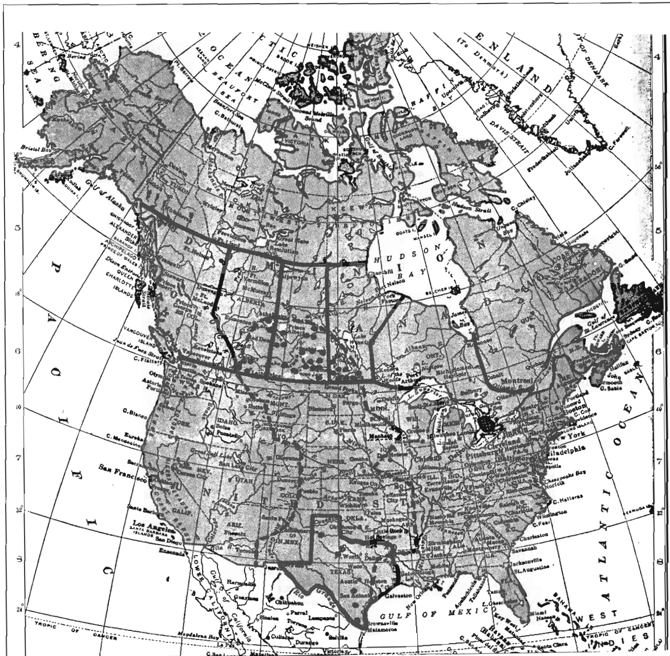
Fig. 2: North American regions having high concentrations of magnesium in drinking-water, and/or, having the lowest mortality rates (see text)

preponderance of Ontario's magnesium-rich hard drinking-waters and where the maximum waterborne magnesium concentration is 49 mg/L [23].